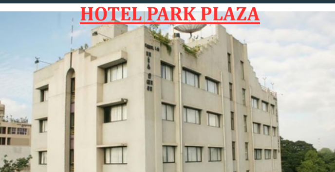
HOTEL PARK PLAZA