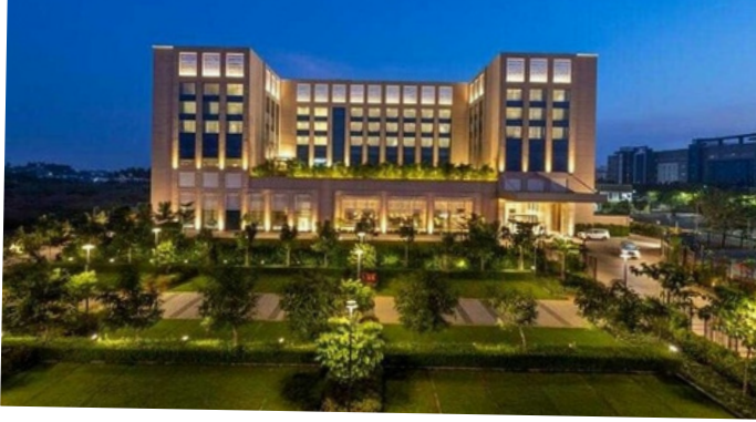
REGENCY MADURAI BY GRT HOTELS