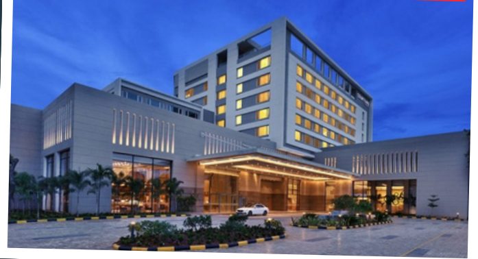
COURTYARD BY MARRIOTT, MADURAI