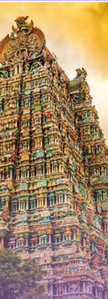
Meenakshi Amman Temple